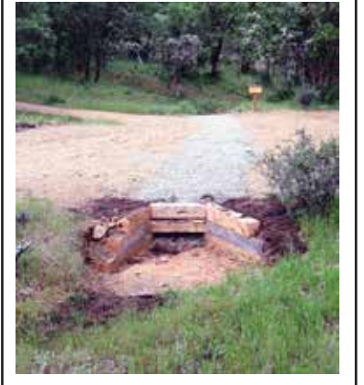
This wooden cut-off collar will help collect running water, and force it through the French drain (gravel-filled ditch) on its journey down the drainage..

Meanwhile, last November, volunteers from three organizations -- JWA, Forest Park, and the Boosters Club -- wheeled in and spread multiple loads of rock and granite to refurbish areas of the French Gulch and Chinese Diggings trails. These trails had suffered erosion and degradation from the wet winter weather. Another partner, the Jackson-ville Parks Department, provided granite and gravel so the volunteers could create a French drain at the bottom of the Chinese Diggings Trail, to help prevent future flooding.